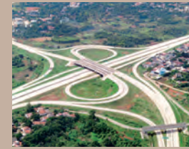
TOL SIMPANG SUSUN PARIGI