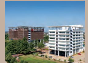
UNIVERSITAS PEMBANGUNAN JAYA