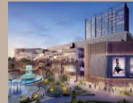
BINTARO XCHANGE MALL