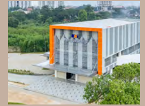
STASIUN PONDOK RANJI